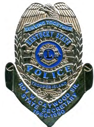
1990 Special 2