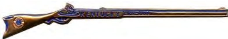
2000 Special 2