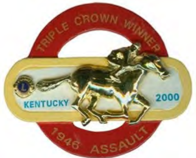
2000 Special 1