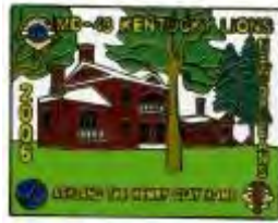
2006 Mini New Orleans