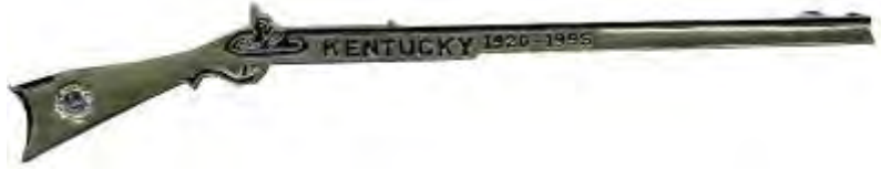
1995 Special 1