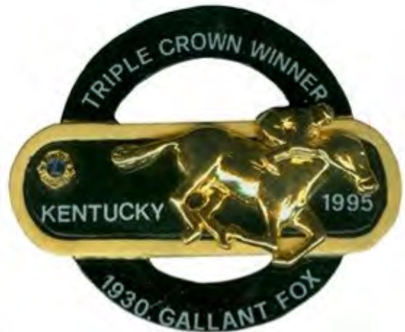
1995 Special 3