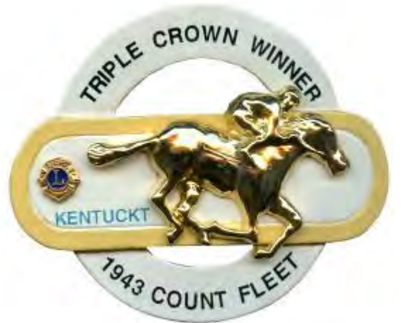
1999 Special V "KENTUCKT"