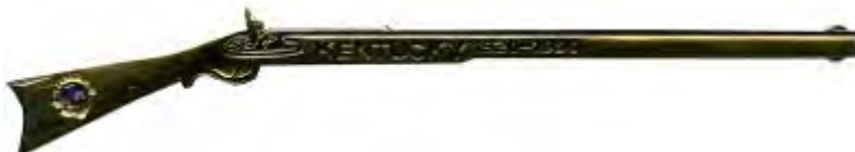
1990 Special 1