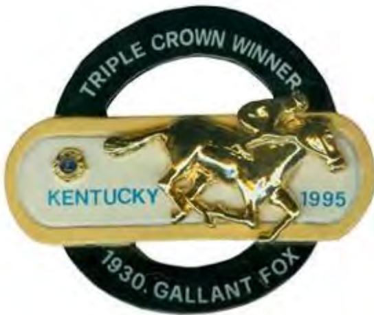
1995 Special 2