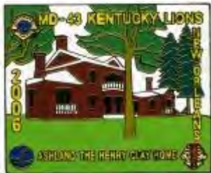
2006 New Orleans